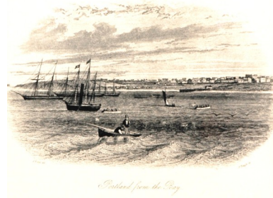
Portland from the Bay, 1857, by S.T. Gill Glenelg Shire Council Cultural Collection