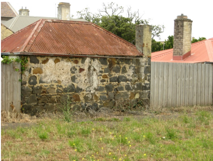
Bluestone outbuilding at 57 Percy Street (significant)