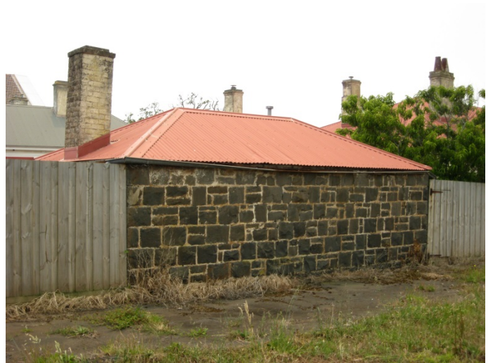
Bluestone outbuilding at 57 Percy Street (significant)