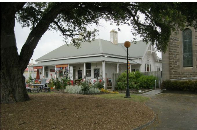
Former Wesleyan Manse, 61B Percy Street (significant)