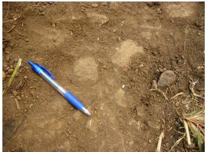
Remnants of macadmised cart track at 55 Percy Street (contributory)