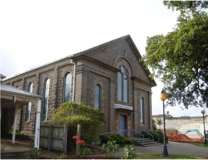
Former Wesleyan Church, 61 Percy Street (significant)