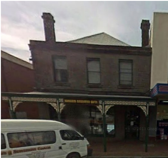
58-60 Percy Street, 2013 (significant)