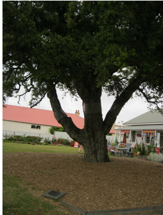
Mature Quercus suber (Cork Oak) in garden of Wesleyan Church and Manse, 61 Percy Street (significant)