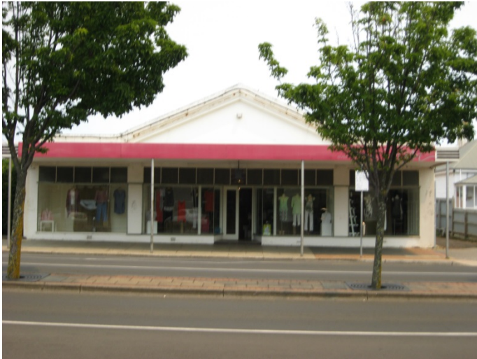
Former Campbells Drapery, 57 Percy Street, built 1868 (significant)