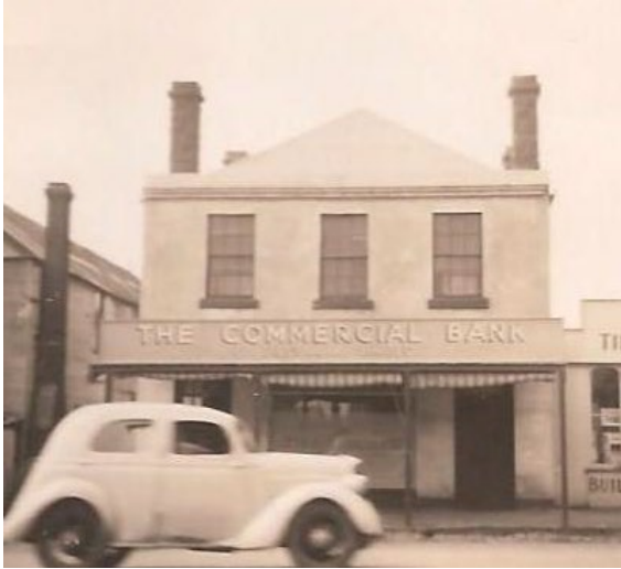
58-60 Percy Street, 1940s