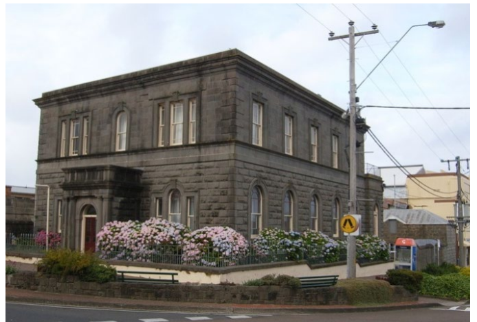
Former Union Bank, 44 Percy Street (significant)