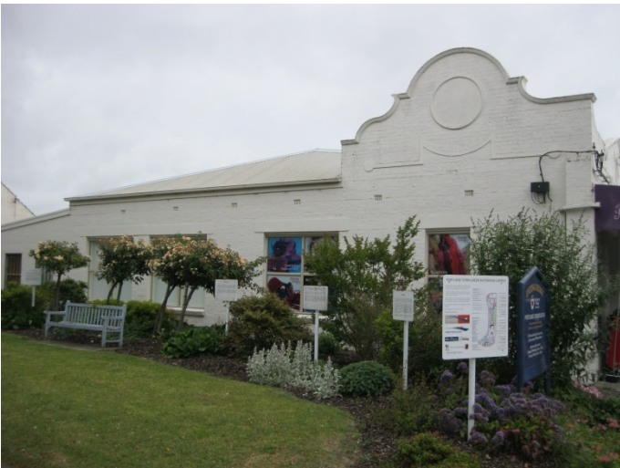
Dutch-style gabled façade at 63 Percy Street (contributory)