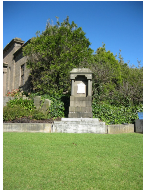
Pioneer Women's Memorial (1935) (contributory)