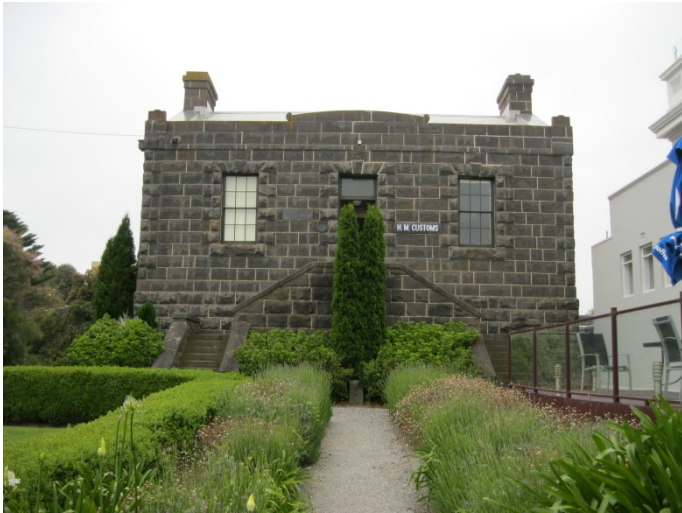
The Customs House (1849-50), 95 Cliff Street, (significant)