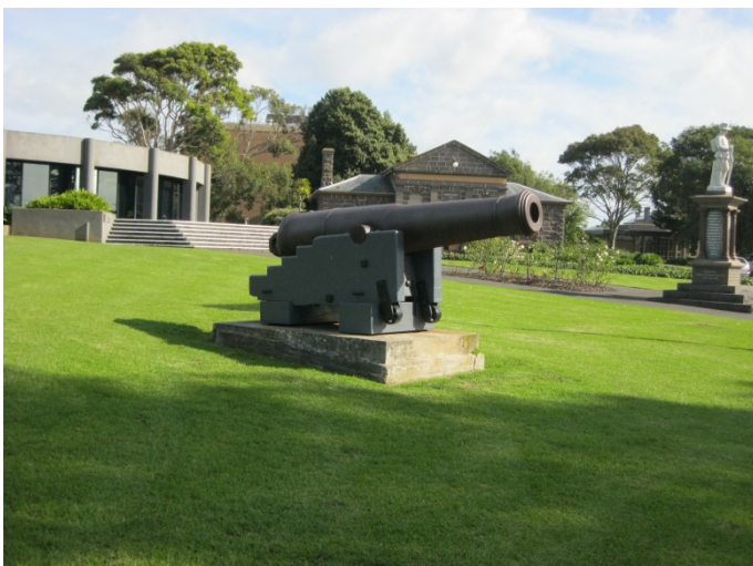
Gun (68 Pounder) in Memorial triangle in forecourt of the Municipal building. (contributory)