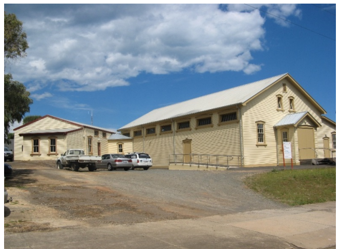
Drill Hall and Gun Shed on Bentinck Street (significant)