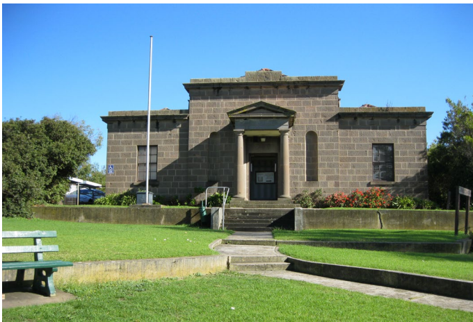
The Court House (1844-45) 67 Cliff Street (significant)