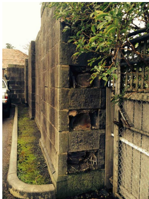
Remnant Portland Gaol wall, 2 Glenelg Street (1844) (significant)