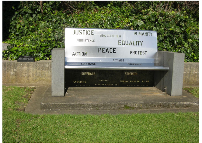
Vida Goldstein Memorial Seat (by Carmel Wallace 2007) (contributory)