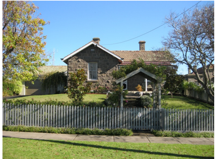
The Police Cottage, 1 Blair Street (1872) (significant)