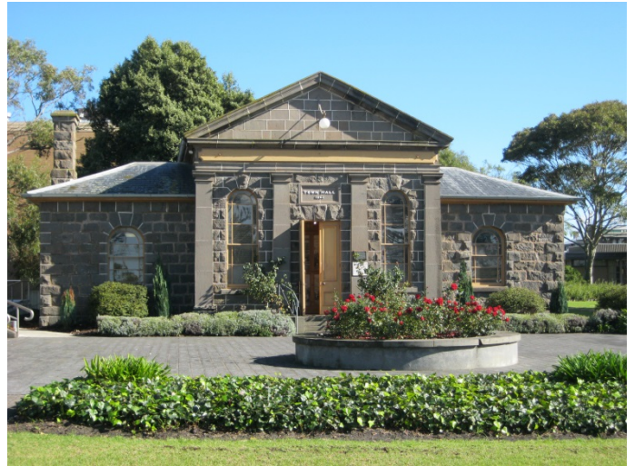
Former Portland Town Hall (1863), 75 Cliff Street (significant)