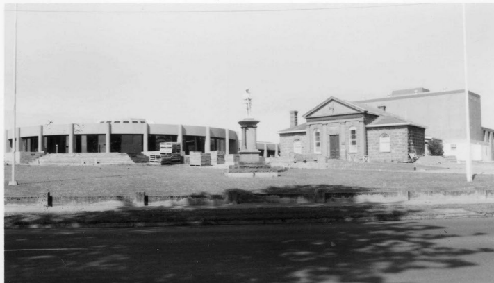
Glenelg Shire Council Municipal building (contributory), shortly after construction and its location next to the former Portland Town Hall (significant). The 1970s library building (non-contributory) is behind the Town Hall