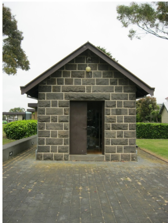
The Rocket Shed (1886), 81 Cliff Street, (significant)