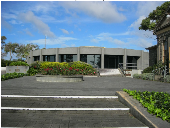
Glenelg Shire Council Municipal Building, 71 Cliff Street (contributory)