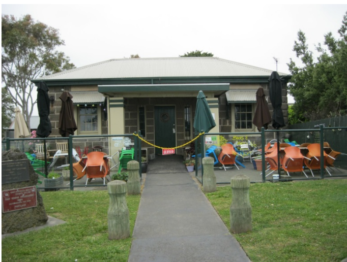
Former Watch House, (1850) 85 Cliff Street. Portico and columns at entrance are a later addition and not significant (significant)