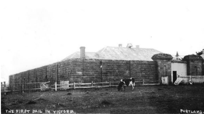
The former Portland Gaol (1844), viewed from corner of Glenelg and Bligh Streets. (Source: Portland Historical Society).