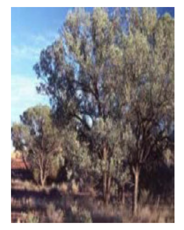
GROUP E- Mallee/ Mulga