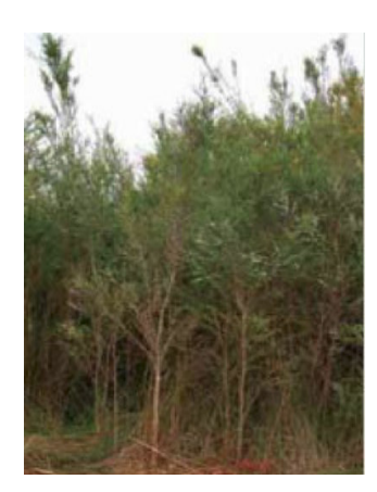
GROUP D- Scrub