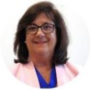
Karen Stephens Mayor

0488 900 645 karen.stephens@cr.glenelg.vic.gov.au