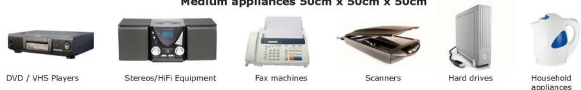
DVD / VHS Players