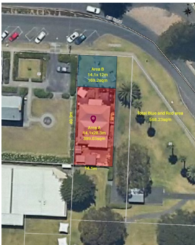
Figure 1. Aerial image of 85 Cliff Street, Portland

It is recommended that Council approves a new three (3) year lease with two (2) x three (3) year extension options with Goodnight Paris Pty Ltd for the property at 85 Cliff Street, Portland.