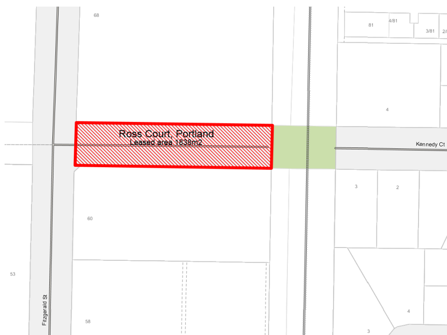
Figure 1. Leased area of Ross Court, Portland

It is recommended that Council approves a new one (1) year lease with two (2) x one (1) year extension options with Lawleg Pty Ltd ta Porthaul Civil Pty Ltd for the land known as Ross Court, Portland.