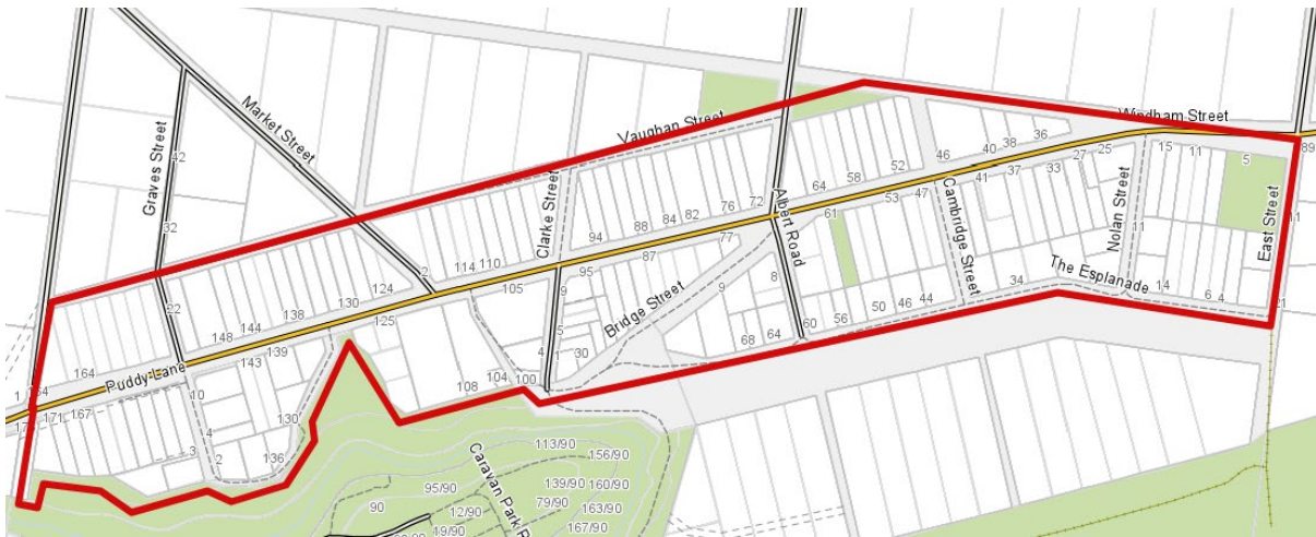
Figure 1 - Narrawong wastewater study area.

Council's Environmental Health Unit assessed a total of 38 residential properties within the township zone of Narrawong (Figure 1), with the consent of owners/occupiers. The inspections assessed the wastewater systems on each property for maintenance accessibility, operation/risk and capacity for future onsite disposal management.