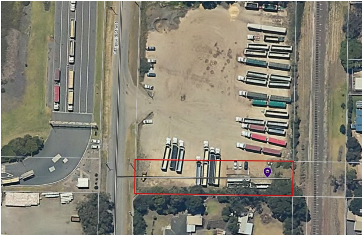
Figure 2. Aerial image of Ross Court, Portland

Our Access, Transport and Technology - Making it easier for people to connect in and around the Glenelg Shire.