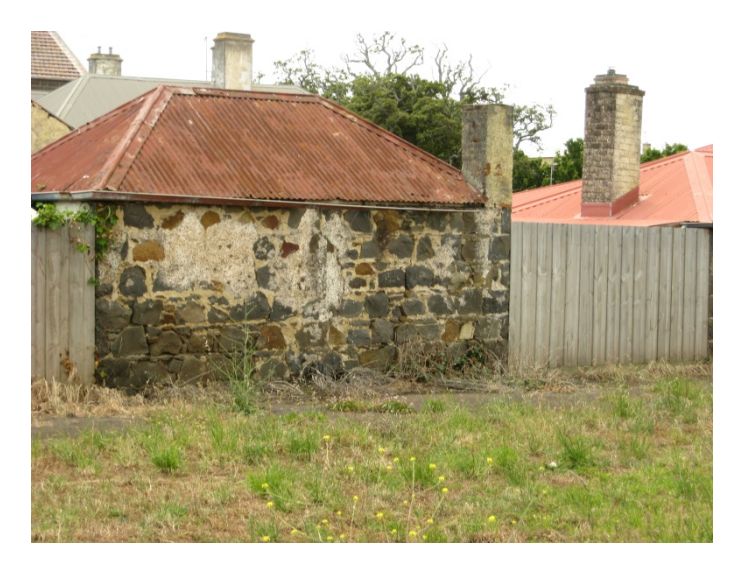
Bluestone outbuilding at 57 Percy Street (significant)