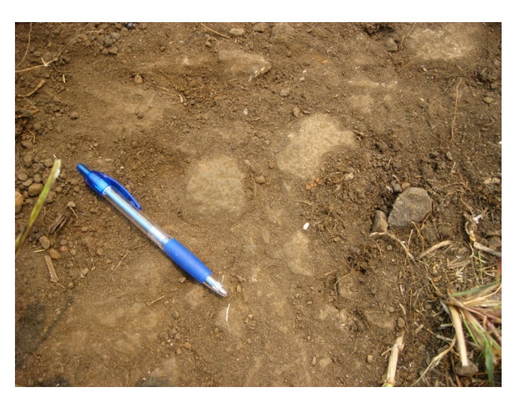
Remnants of macadmised cart track at 55 Percy Street (contributory)