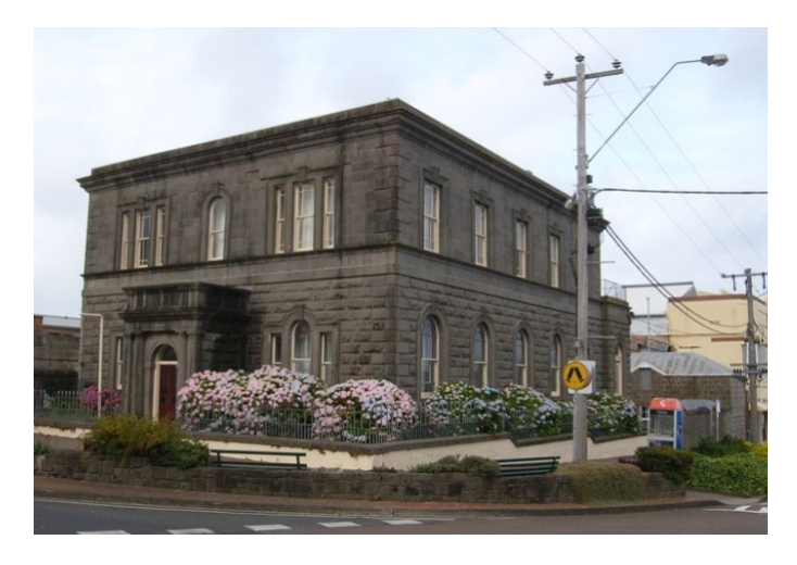
Former Union Bank, 44 Percy Street (significant)