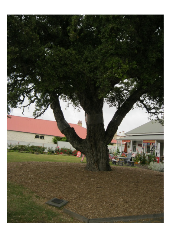
Mature Quercus suber (Cork Oak) in garden of Wesleyan Church and Manse, 61 Percy Street (significant)