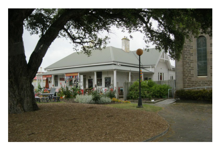
Former Wesleyan Manse, 61B Percy Street (significant)

Dutch-style gabled façade at 63 Percy Street (contributory)