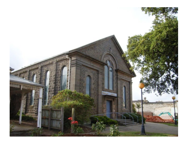
Former Wesleyan Church, 61 Percy Street (significant)