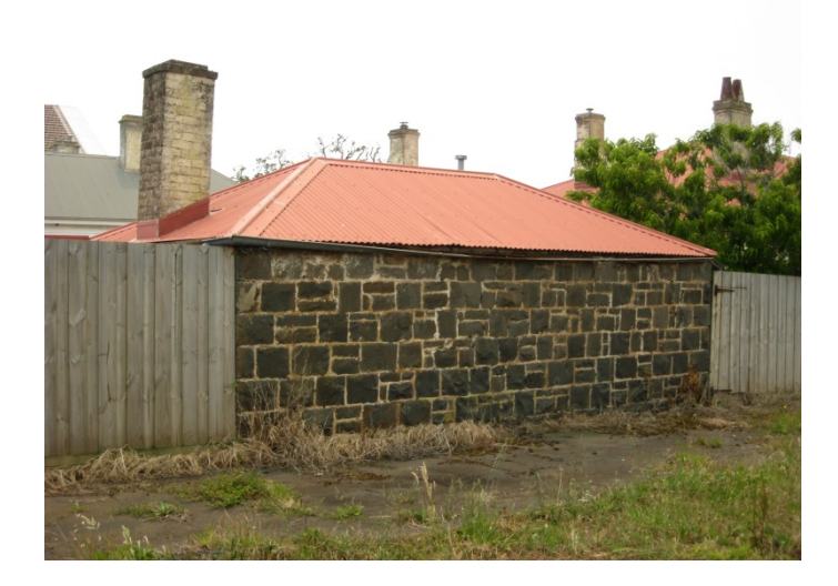
Bluestone outbuilding at 57 Percy Street (significant)