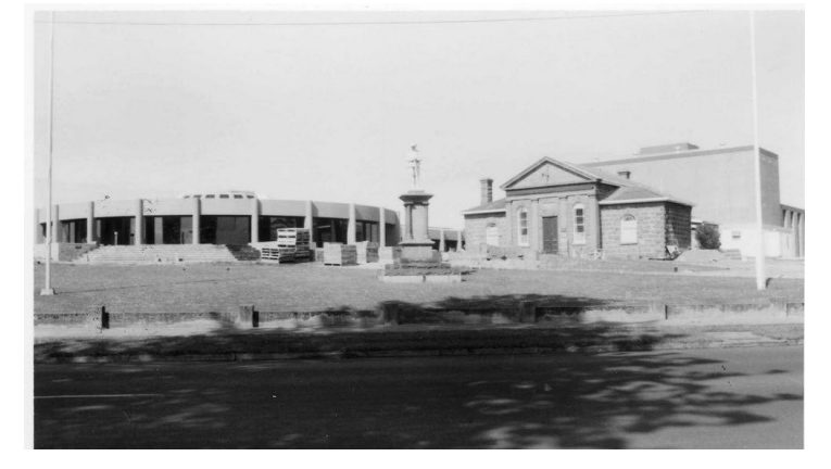
Glenelg Shire Council Municipal building (contributory), shortly after construction and its location next to the former Portland Town Hall (significant). The 1970s library building (non-contributory) is behind the Town Hall