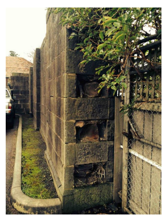
Remnant Portland Gaol wall, 2 Glenelg Street (1844) (significant)