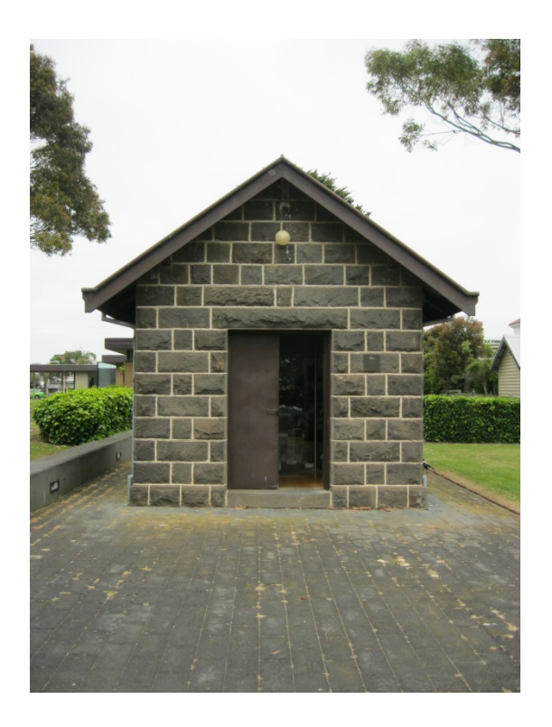
The Rocket Shed (1886), 81 Cliff Street, (significant)