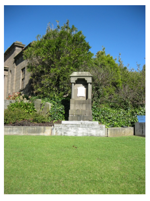
Pioneer Women's Memorial (1935) (contributory)