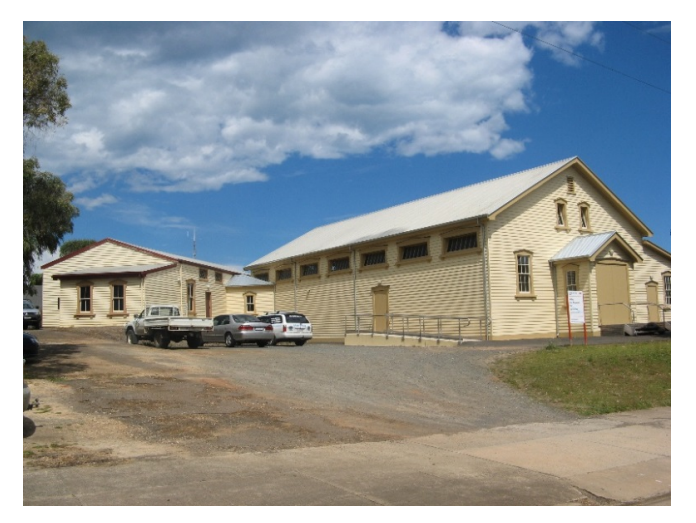
Drill Hall and Gun Shed on Bentinck Street (significant)