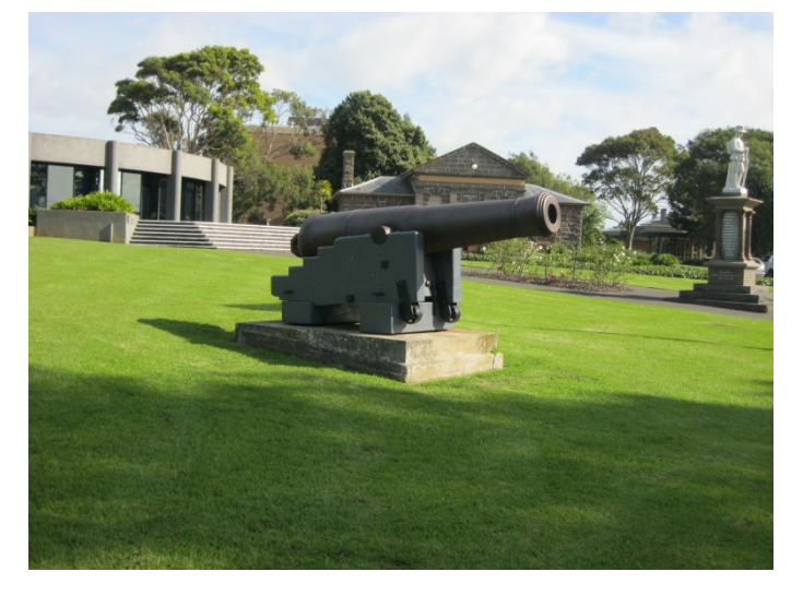
Gun (68 Pounder) in Memorial triangle in forecourt of the Municipal building. (contributory)