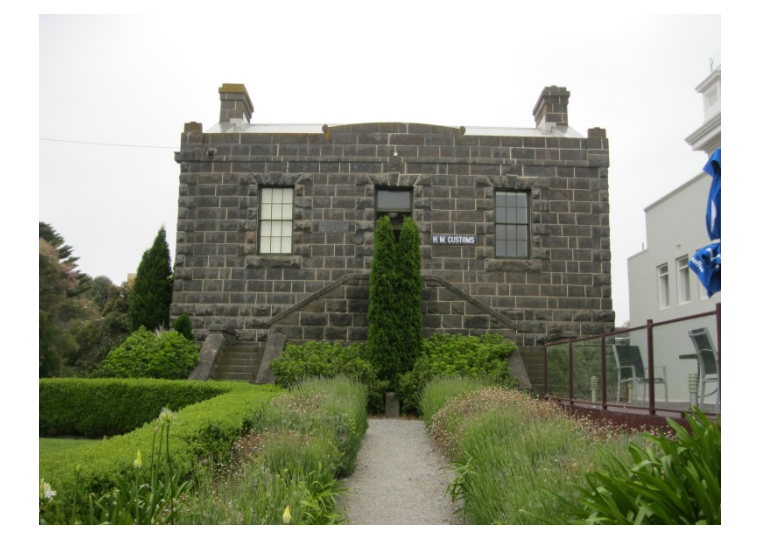
The Customs House (1849-50), 95 Cliff Street, (significant)