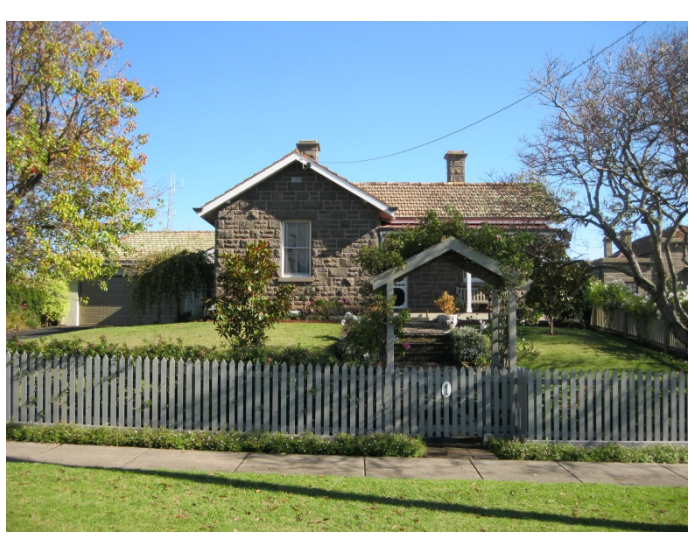
The Police Cottage, 1 Blair Street (1872) (significant)