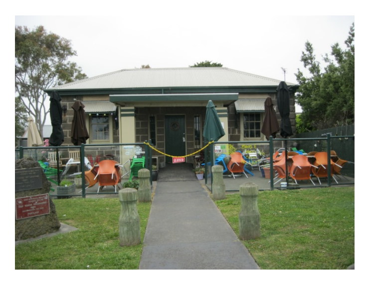
Former Watch House, (1850) 85 Cliff Street. Portico and columns at entrance are a later addition and not significant (significant)