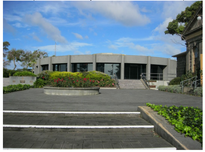
Glenelg Shire Council Municipal Building, 71 Cliff Street (contributory)