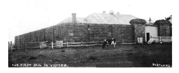
The former Portland Gaol (1844), viewed from corner of Glenelg and Bligh Streets.