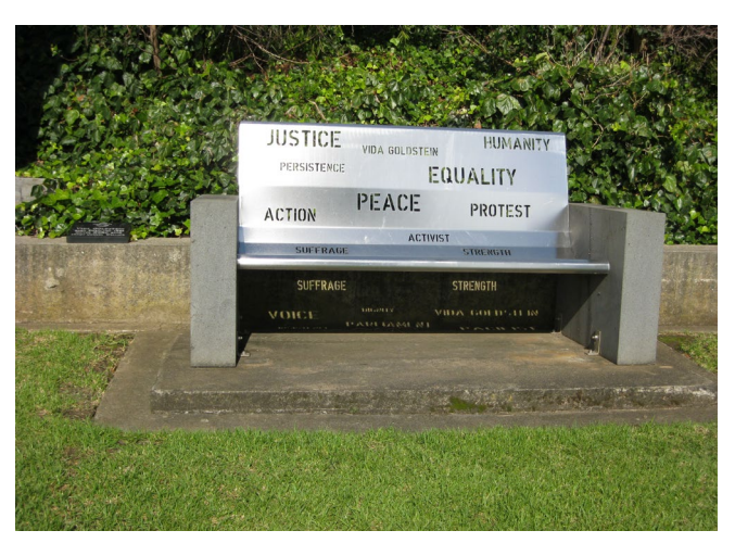
Vida Goldstein Memorial Seat (by Carmel Wallace 2007) (contributory)