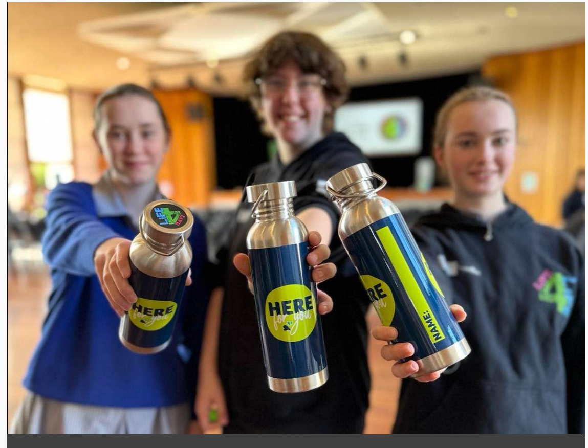
Huge shout out to Wannon Waters Ripple Effect Sponsorship program. Live4Life Glenelg received 80 drink bottles for our year eights, which were given out during the Launch Day in May.