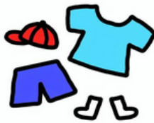
CHANGE OF CLOTHES